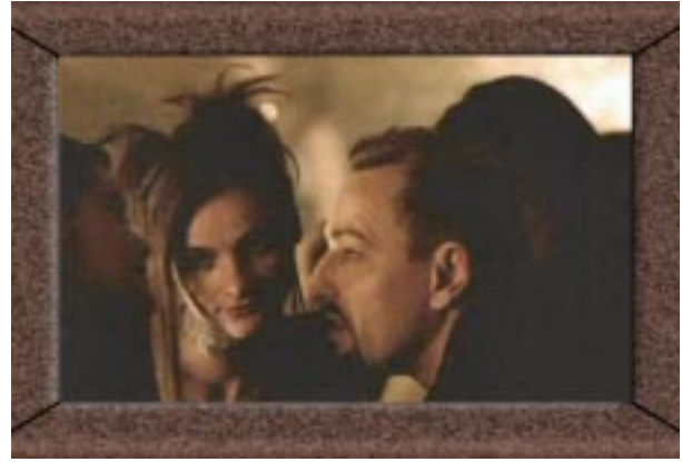
The Neighbor. It's a beautiful day in the neighborhood...